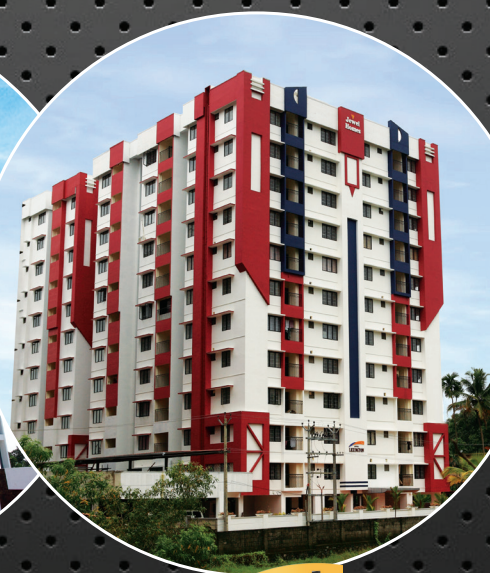
Jewel LEXINGTON PREMIUM APARTMENTS RAJAGIRI VALLEY, KAKKANAD