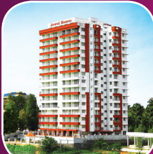
JEWEL RIVER WOODS Waterfront, Luxury Apartments, Aluva