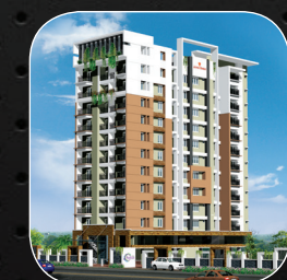
Jewel Radius Premium Apartments Vazhakkala