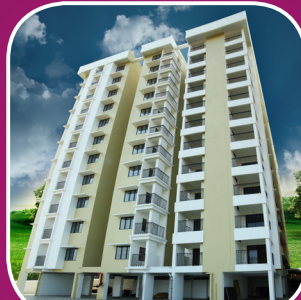
JEWEL RIDGE VIEW Premium Apartments Rajagiri Valley, Kakkanad