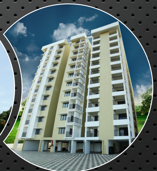
Jewel Ridge View Premium Apartments RAJAGIRI VALLEY