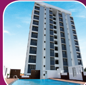
JEWEL KENNINGSTON Premium Apartments Rajagiri Valley, Kakkanad