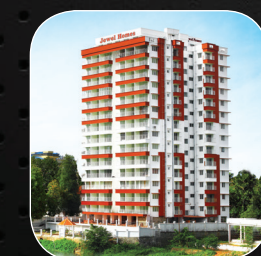
Jewel River Woods Waterfront Luxury Apartments Aluva