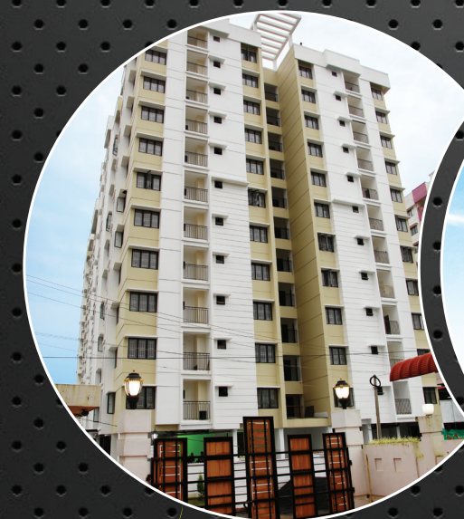
Jewel Crest View RESIDENTIAL APARTMENTS OFF. IT ROAD, KAKKANAD