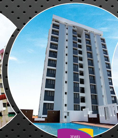
Jewel KENNINGSTON PREMIUM APARTMENTS RAJAGIRI VALLEY, KAKKANAD