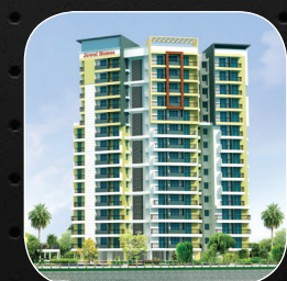
Jewel Water Lily Waterfront Premium Apartments Nagampadam, Kottayam

Move into happiness now. Jewel Homes offers projects of the finest standards with world class amenities and premium living spaces at the best locations in Kakkanad. Call us to take your pick today!